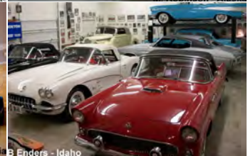
B Enders - Idaho