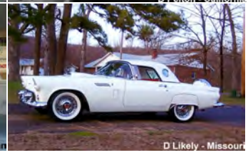
D Likely - Missouri