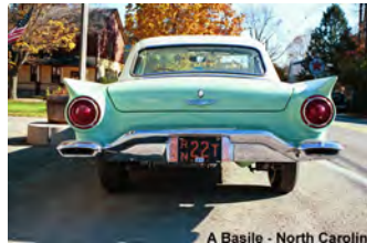
A Basile - North Carolina