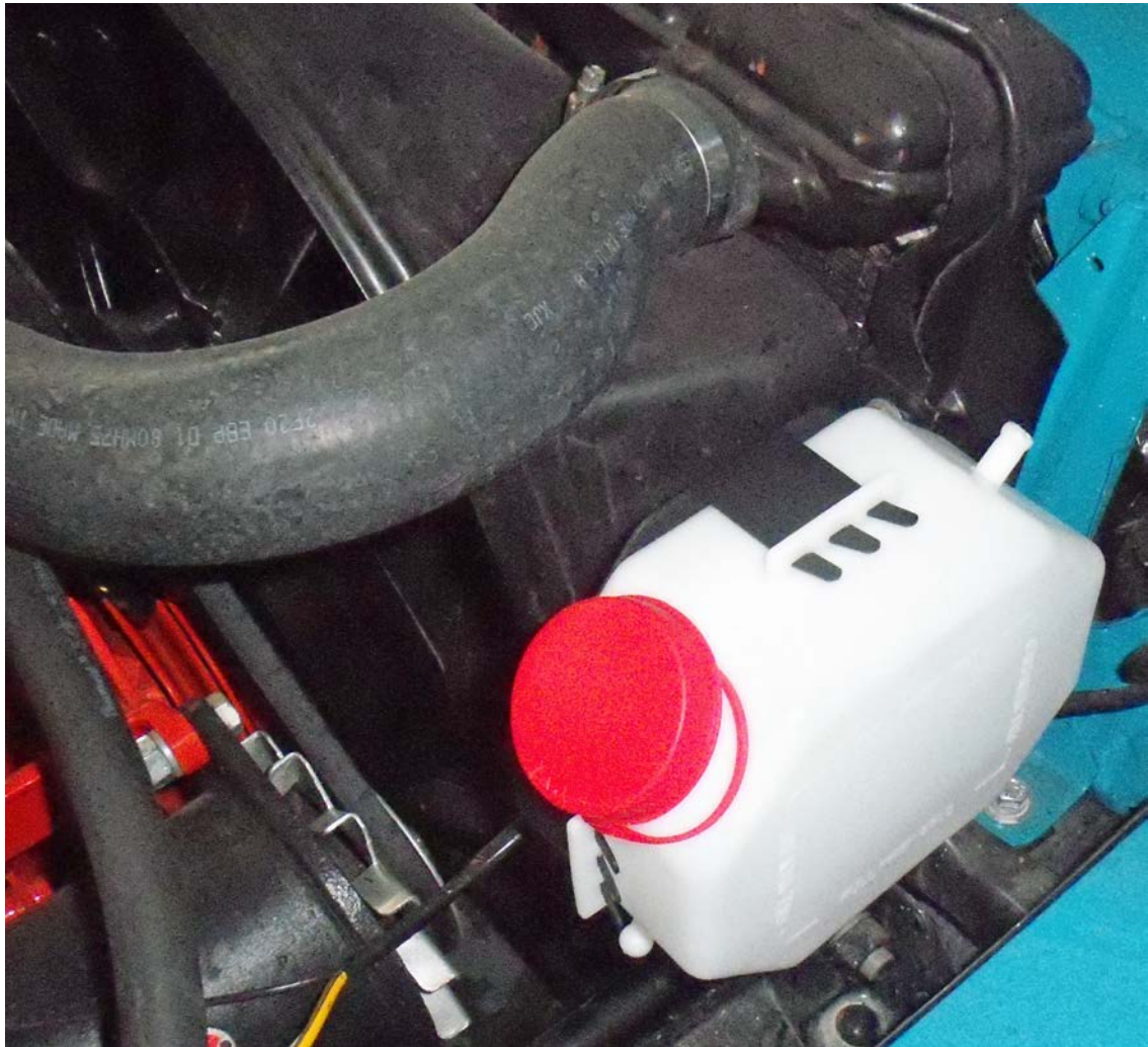
Coolant Recovery Kit