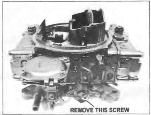
REMOVE THIS SCREW Figure 2