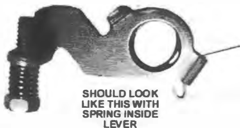
SHOULD LOOK LIKE THIS WITH SPRING INSIDE LEVER