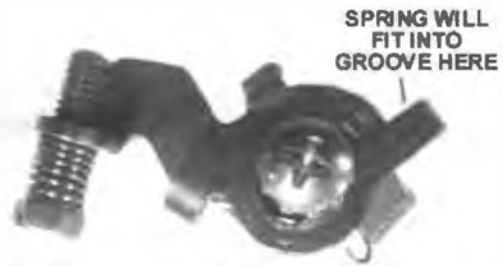
SPRING WILL FIT INTO GROOVE HERE