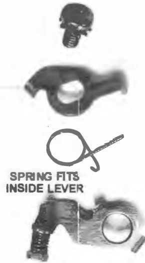
SPRING FITS INSIDE LEVER